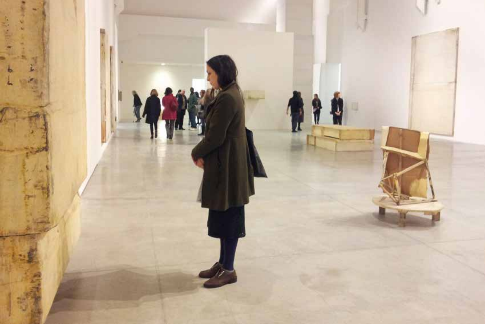
SACI GRADUATE STUDENTS VISITING THE MAMBO MUSIUM, BOLOGNA

Applicants for scholarships must apply by March 15 .