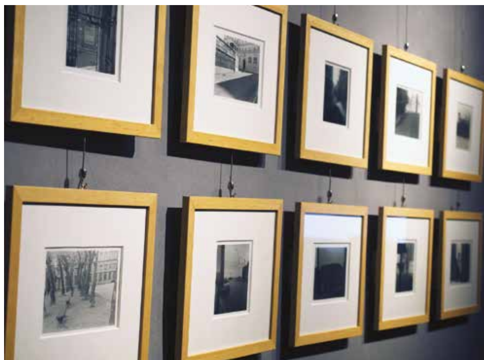
MFA IN PHOTOGRAPHY FINAL EXHIBITION IN TETHYS GALLERY, FLORENCE

Students in the program are allotted studio space in the Jules Maidoff Palazzo for the Visual Arts. This is a four-floor, 16,000 square foot building located in Florence's historic center at Via Sant'Egidio 14.