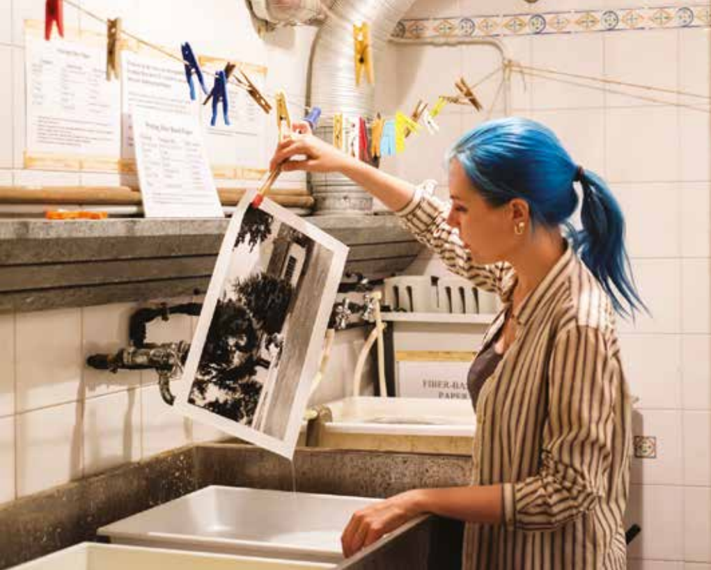
MFA IN PHOTOGRAPHY STUDENT IN A SACI DARKROOM

It is a short distance from such famous sites as the Duomo and Brunelleschi's Ospedale degli Innocenti, and is close to Florence's four great piazze —Piazza Santa Croce, Piazza della Signoria, Piazza della Repubblica, and Piazza della Santissima Annunziata. Named after SACI's founder and director emeritus, the palazzo also includes classrooms, a garden, terraces, audio-visual equipment, and computer facilities that can be used for photography and studio art projects. The Palazzo is open from 9:00 am to midnight seven days a week.